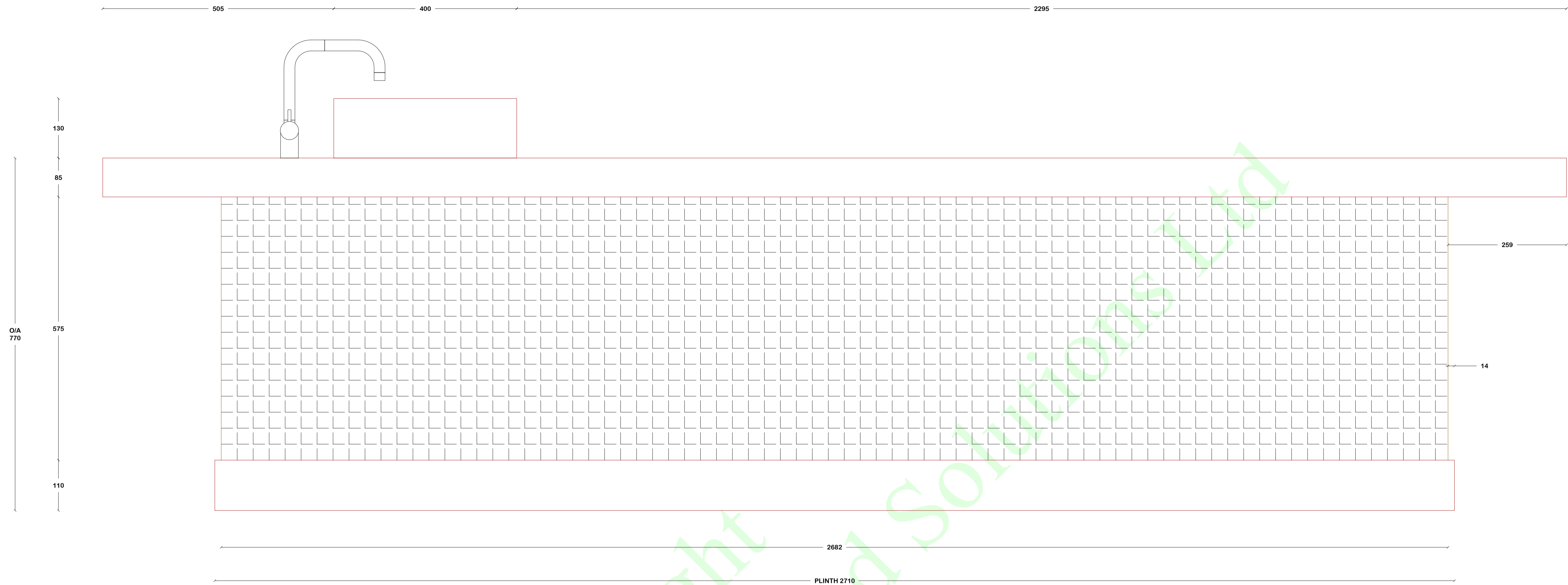
ELEVATION 01 DETAIL 1:5